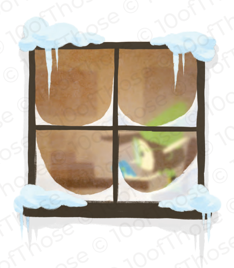
When Santa learned the gospel, he first heard it from an elf. This tiny Santa's helper had just learned of it herself.