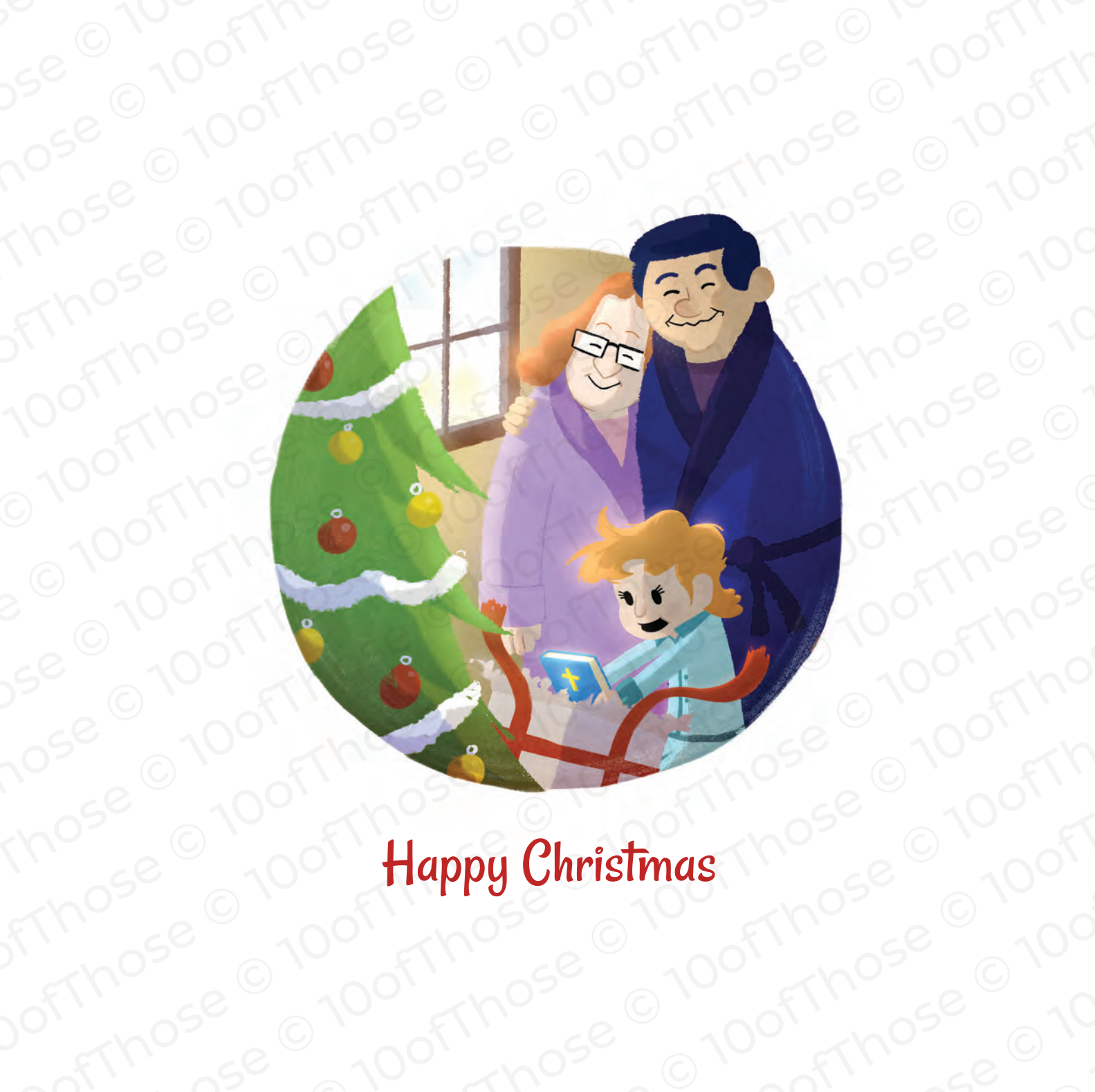
CETHOSE © 100FT 100FThose o 10 cea @ 100FThos