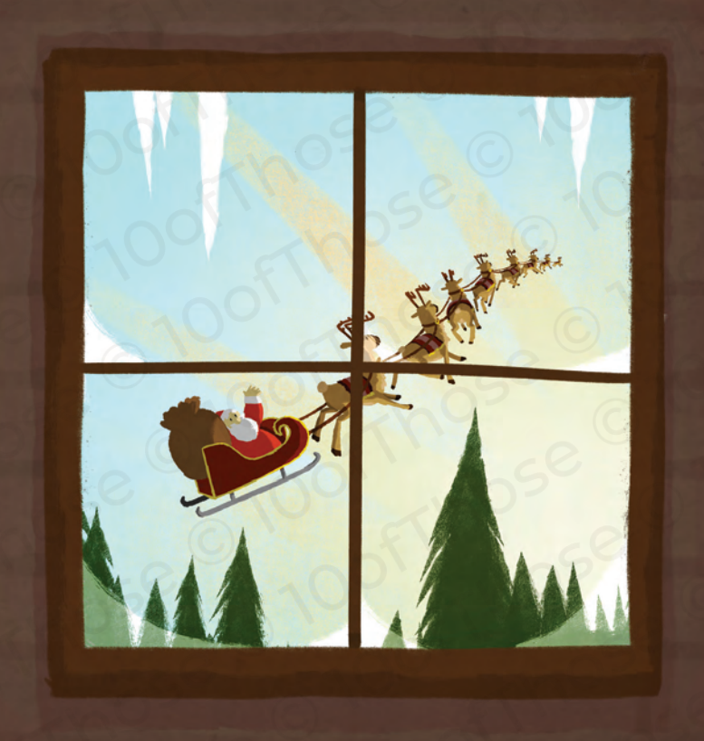
And now, in Christ, forgiven, free his new life had begun

and Santa had a new message to share with everyone.