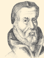
WILLIAM TYNDALE 32