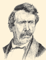
DAVID LIVINGSTONE 100