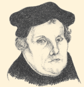
MARTIN LUTHER 22