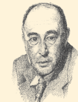
C. S. LEWIS 174