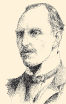
C. T. STUDD 150