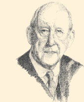
DR. MARTYN LLOYD-JONES 180