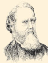
HUDSON TAYLOR 118