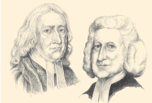
JOHN & CHARLES WESLEY 66