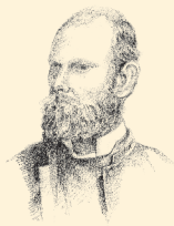
JAMES HANNINGTON 138