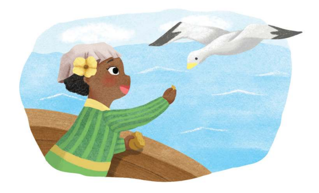
... and bad days. "Fish, again?!"